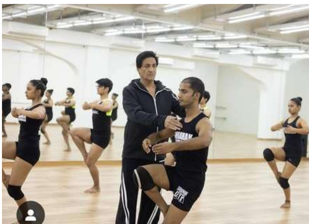
Intensive Dance Trainings in 2024-25 Founder actively teaches at the OYP and monitors the students' progress through the year