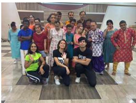
Regular Dance Training Batch @ Matunga Total Batches: 6 No. of Students trained: 95