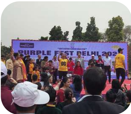
Inclusive Dance Workshop @ Rashtrapati Bhavan, New Delhi