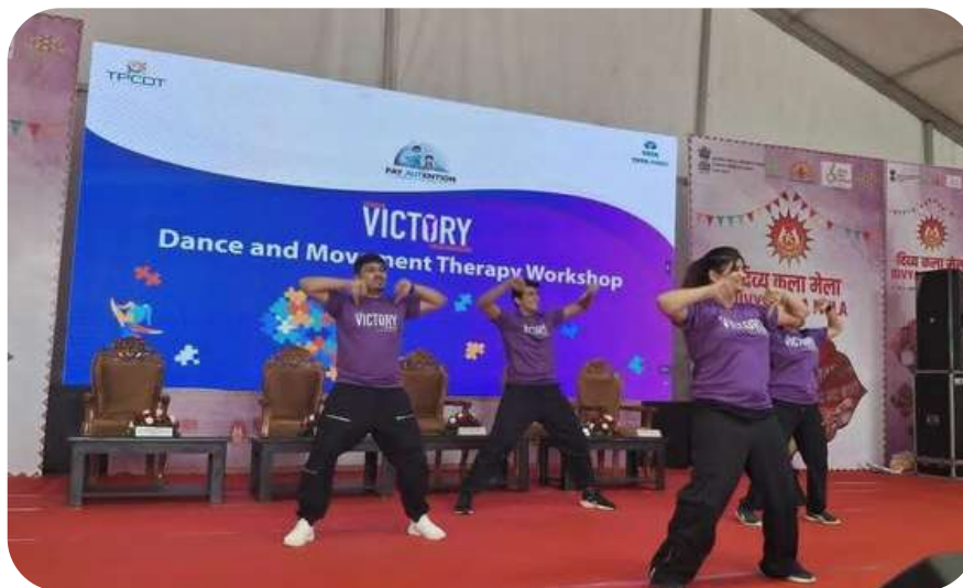
Dance Workshop at Divya Kala Mela for PwDs at Madhya Pradesh