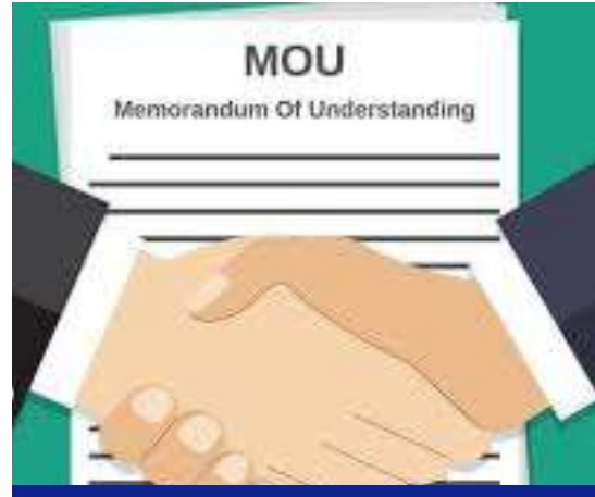
MoU with TATA POWER LTD (CSR) To implement Dance & Movement Therapy @ PAN INDIA level