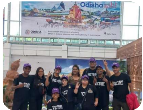
Best of ASCO Show, Bhubhaneswar