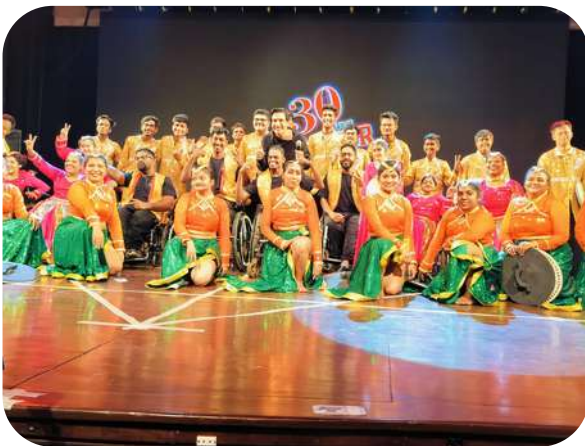
Summer Funk 2024