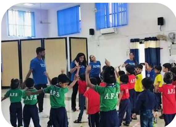
Dance Workshop @ Air Force School, Madh Island