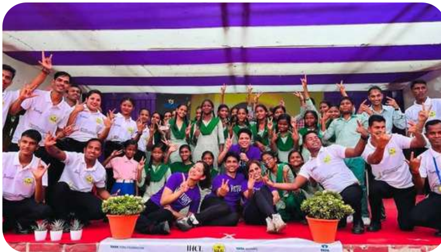
Dance Workshop at East Zone Neurodiversity Summit and Abilympics Meet', Jamshedpur