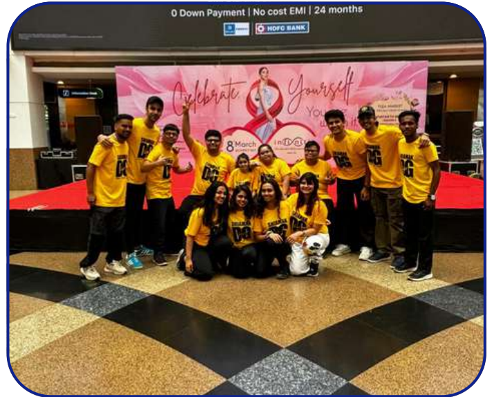
Infiniti Mall - Celebrating International Women's Day - 8th March 2024