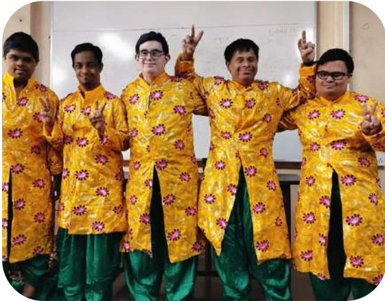
Winter Funk 2023