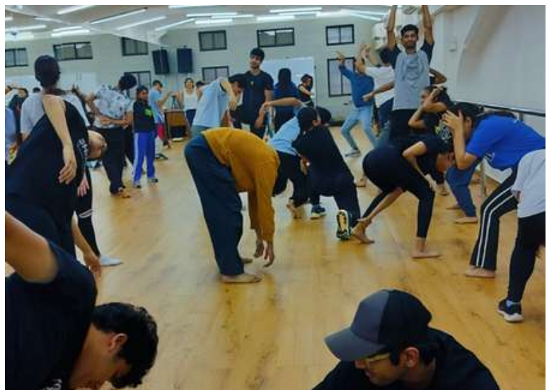
A Training on Sensitization for the Instructors (Dance & Movement Therapy)