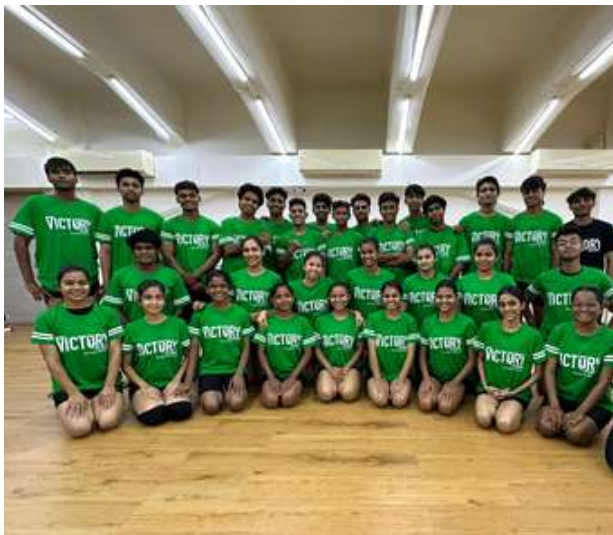
30 Scholarship support received to the students for the academic year 2024-25 by Reliance Foundation

Victory Arts Foundation awarded total 53 scholarships from the academic year of 2023-24 & 2024-25 to the students belonging to the economically disadvantaged sections across India.