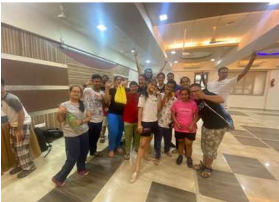
Regular Dance Training Batch @ Andheri Total Batches: 2 No. of Students trained: 16