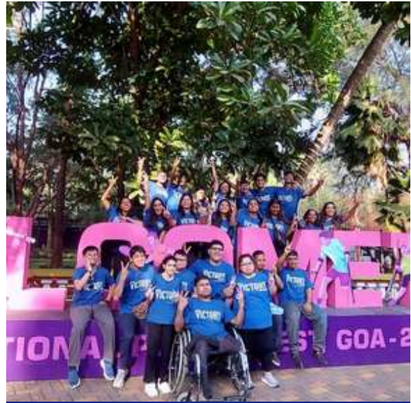
Victory Dance Teams (VDT & VOW) @ International Purple Fest in January 2024, Goa