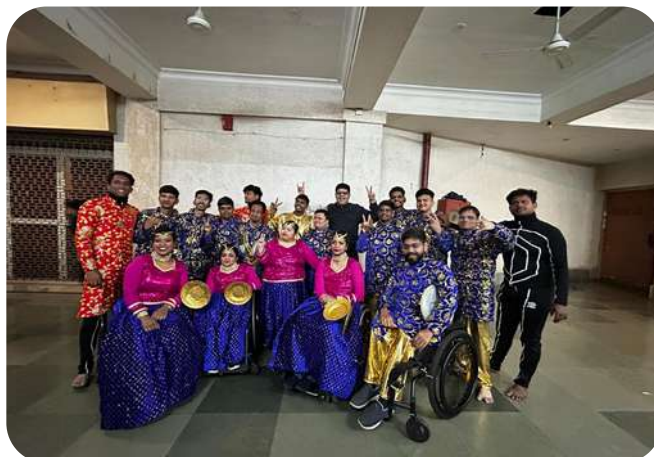
Winter Funk 2024