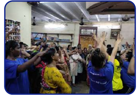
AAWC NGO, Commercial Sex Workers, Kamathipura