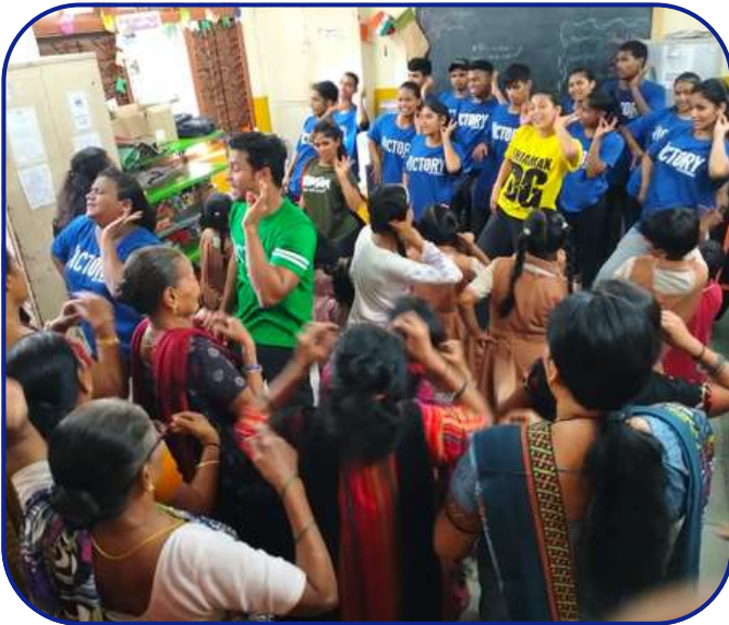
AAWC NGO - Commercial Sex Workers, Red Light Area, Falkland Road