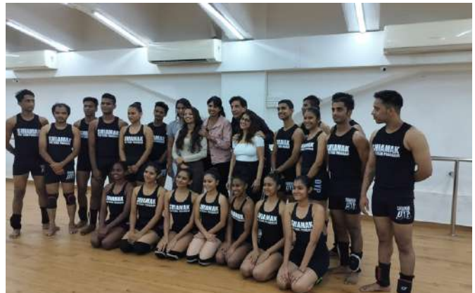
23 Scholarship Support received for the academic year 2023-2024 by BOOKASMILE