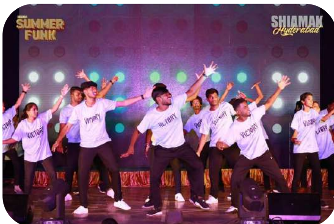
Dance Training provided to students with hearing impairment at SWEVKAR NGO Hyderabad 2023