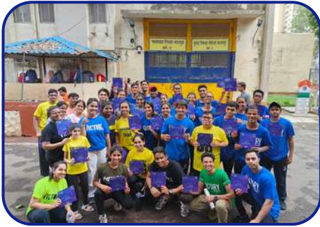
Byculla Prison Prison Inmates