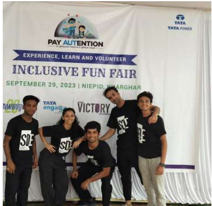
Inclusive Dance Workshop @ NIEPID Kharghar - In association with TATA POWER LTD