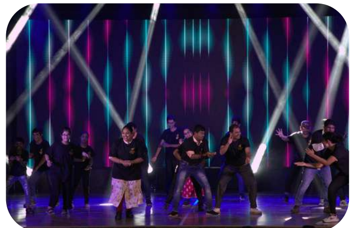
Dance Training provided to intellectually challenged students at SWEVKAR NGO Hyderabad 2023