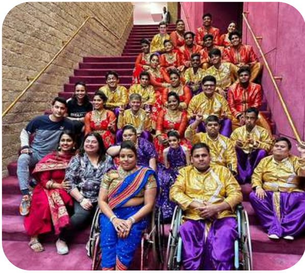
Tata Trent Show @NCPA 2023