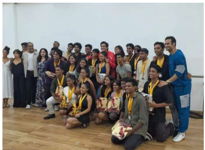
Convocation & Certification of OYP Graduates

Read More on our website www.shiamak.com/oyp/