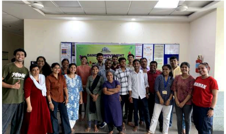
5-days Dance offline Training @ NIEPID, Kharghar with special educators, students, volunteers in association with our CSR Partner Tata Power Ltd