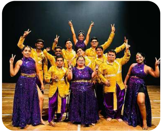
Summer Funk 2023