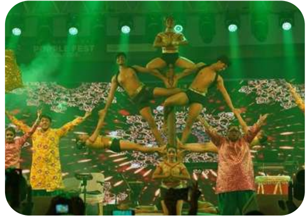
International Purple Fest 2023