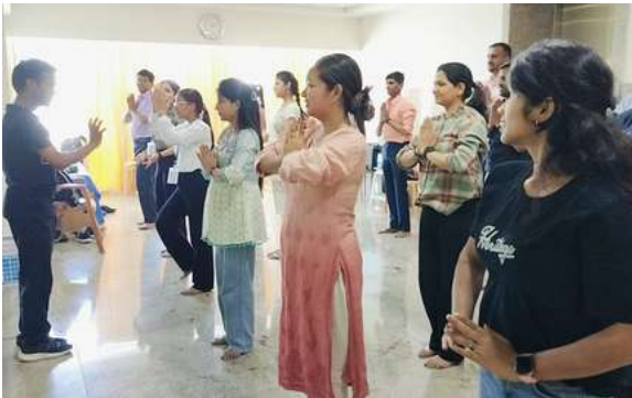
Training Tata Memorial Hospital Navigators for their Convocation Ceremony

Dance training transforms lives, empowering individuals to express themselves, overcome challenges, and realize their potential. It is not merely a skill but a catalyst for change and self-discovery.