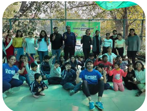
Dance Workshop @ SHAD Centre, Rohini, New Delhi