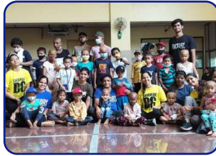
ACTREC, Navi Mumbai Children under Oncology treatment