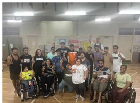
Regular Dance Training Batch @ Victory Dance Teams Total Batches: 6 No. of Students trained: 40