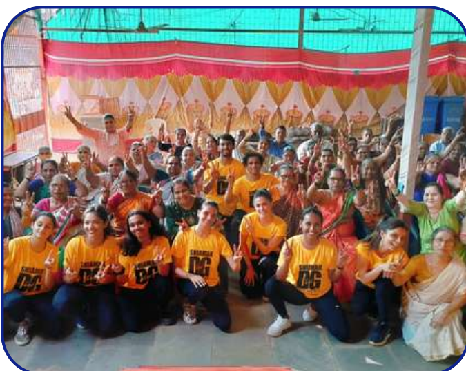
Dignity Foundation, Jogeshwari