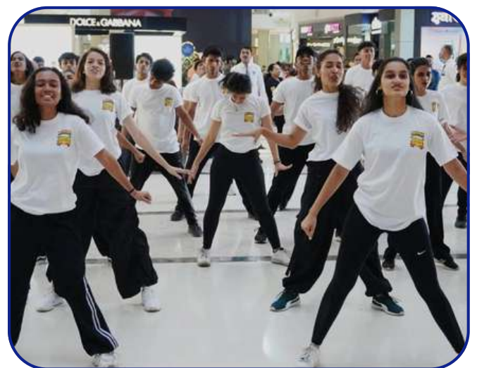
CRY NGO - Educating a Girl Child without interruptions