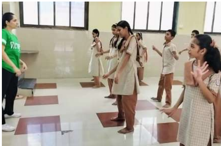
Dance Classes at Salaam Bombay Foundation partnered BMC School - Prabhadevi