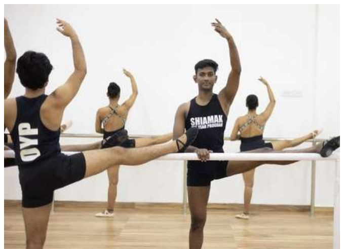
Intensive Dance Trainings in 2023-24 focused on different techniques and training in over 8 dance styles