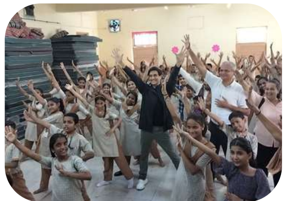
Dance Workshop @ Colaba Municipal School