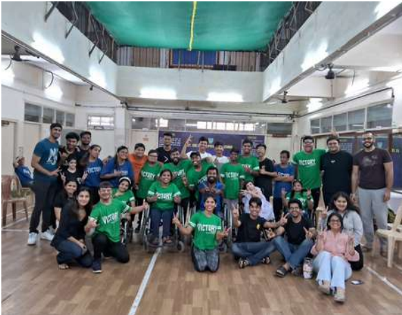
MoU with ROTARACT CLUB OF HANGING GARDEN To conduct engaging activities with Victory Dance Teams

Strategic partnerships and associations are the backbone of sustainable development in dance initiatives, ensuring that the transformative power of dance reaches those who need it most.